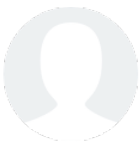
Jeffrey Fleming, LLC