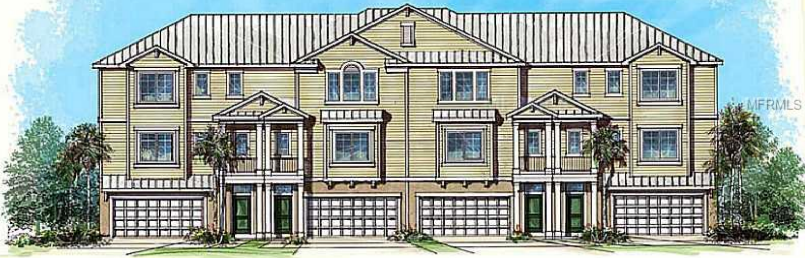
The Landings at Coral Creek