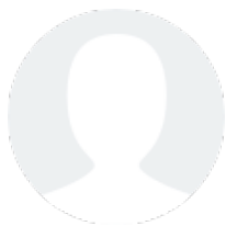
Kari Battaglia, PA

Active with contract taking backup offers. Short Sale. If you are looking for a great deal and are willing to put a little work into the property than look no further. This newer Gardens of Gulf Cove 3BR/2BA/2CG is waiting for you. Located on nice quiet streets – this split floor plan flows nicely from [...]