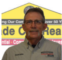
Scott Boise Dade City Realty

PALAMINO LAKES! 4 BDRM, 4 BA Ranch home on 10.3 acres with pond frontage. Completely renovated in 2014! Custom kitchen, 2 Master Suites, Living Room with Wood Burning Fireplace, Two screened Porches (one with Outdoor Kitchen), Saltwater Pool with Beach area, Jacuzzi and Paver Deck. Gazebo set up for grill and smoker. Concrete block Pool [...]