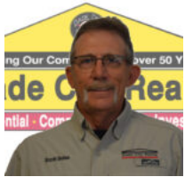
Scott Boise Dade City Realty

Welcome to old Florida! Priced at over $165,000 under assessment! This 76.56 acres includes an adjoining 1 acre parcel included in price! Located between Dade City and Zephyrhills, currently used for cattle. Part pasture, part woods with campsite overlooking a large pond. Barn with well and power. Prime location for your new ranch!